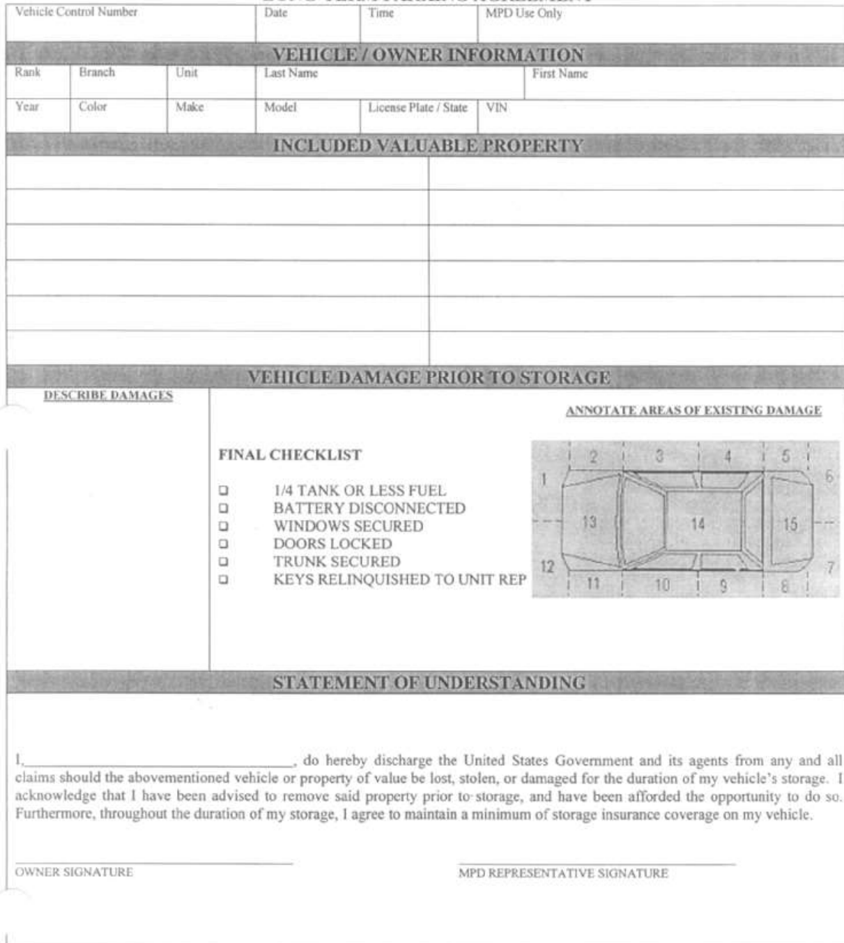
Figure 2-2. DEPLOYMENT STORAGE AGREEMENT